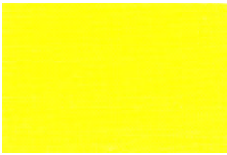
Lemon Yellow MX-8G