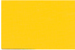
Sunshine Yellow MX-GR