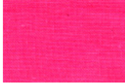
Clear Red MX-5B