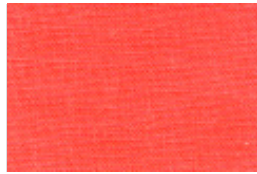
Warm Red MX-GBA