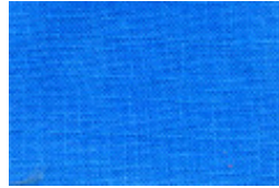
Super Blue (conc.) MX-G