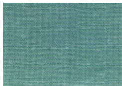
Forest Green MX-CBA

1-800-327-8448 www.earthguild.com Spring 2010