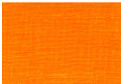
Bright Orange MX-2R