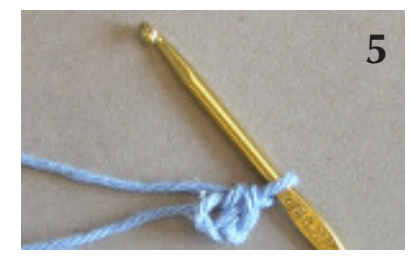
YO, pull through 2 LPs. 1 LP on hook.