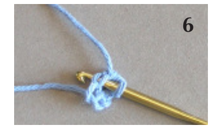
Now insert your hook into the CH just before the bars, but on a narrow edge of the braid, to start the second ST. This will be easier to see after you have worked several ST.