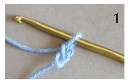
CH 2 (counting slip knot as 1, don't pull it tight), leave about 4 inches of tail.

(Please note: the following pictures are of a very short loop, in order to show all of it in detail. For a cowl, you will have many more stitches, but the process is identical.